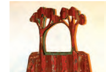
PETRA SVOBODA - GOCCO-NEKO (MAKE BELIEVE CAT)