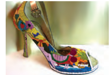
ANGE LEECH - 1956 HORSEPOWER