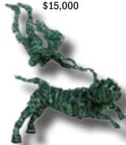
13 - Walkies

76 Trak Spex sh 6 Village Walk Deborah Halpern Eye Peace $15,000