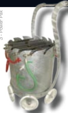
3 - Power Pak