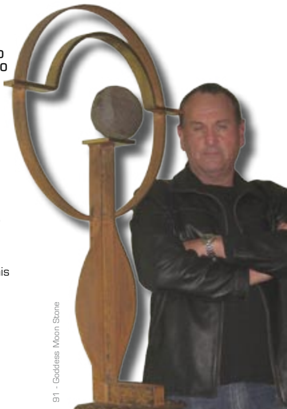
91 - Goddess Moon Stone