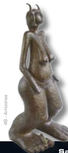
48 - Amazonas

67 Sa Dot Na 513 Toorak Rd Deborah Edwards Flux (ed 2) $4,400