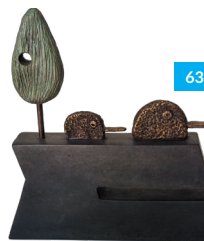
65 SIMON JOHNSON

515 Toorak Rd Steve Drew Horse Glazed stoneware ceramic $800