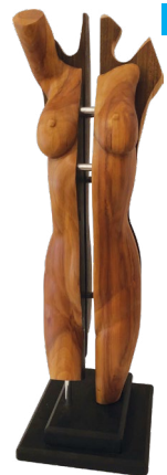
69 TOK H CENTRE

5 Tok H Centre Graham Duell I Need You! Ceramic (unique) $3,000