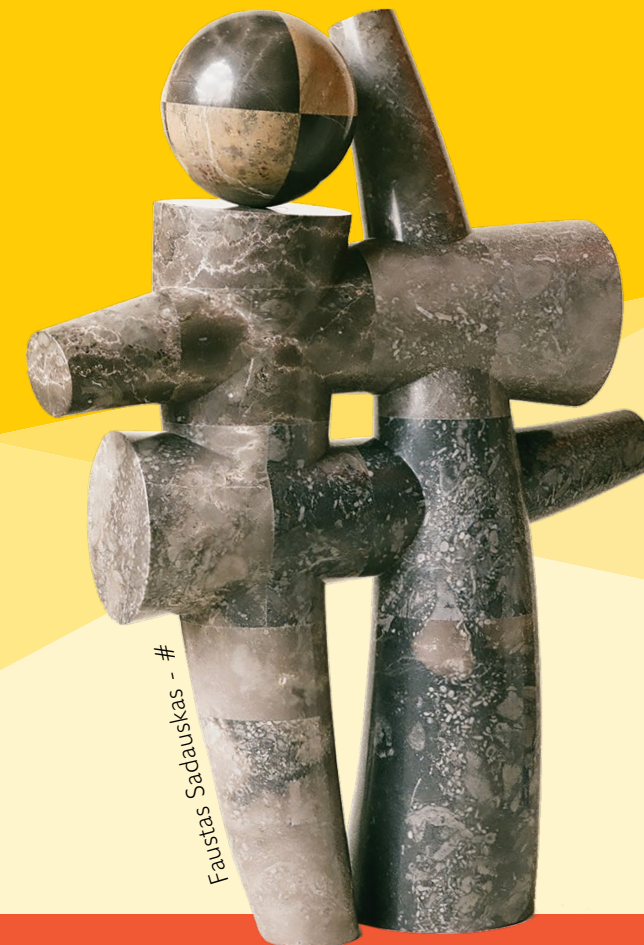
Frustas Sadauskas - #