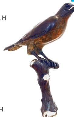
78 C WERNER & CO