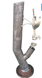
55 J'ADORE BROWS & LASHES

13 Toorak Place Ruby J Forrester Tender Moment Bronze 1/20 $2,500